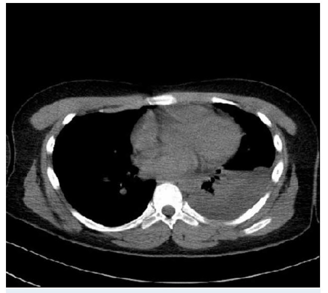
Figure-2: In mediastinal window section tomography of the lungs, pleural effusion in the basal segment of the lower lobe of the left lung, and atelectasis in the adjacent lung parenchyma