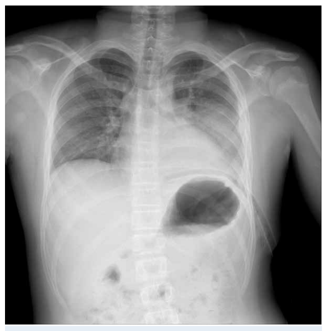
Figure-1: Infiltration and pleural effusion in the middle and lower lobe of the left lung

Intravenous (iv) ceftriaxone 80 mg/kg/day was initiated in two doses. At approximately 48 hours of hospitalization, the chest X-ray of the patient with respiratory distress and continuing fever was repeated; thorax ultrasonography (USG) was performed due to the presence of effusion in the left lung. The thorax USG showed an effusion of 5.5 cm in the same area. A chest tube was inserted to the patient and the laboratory examination of the drained liquid material showed glucose to be 84 mg/dL, LDH: 766 U/L, protein: 4202 mg/dL, density: 1010, leucocyte: 55/mm³, erythrocyte:1500/mm³ and ADA: 46.3 U/L (N: 5-30 U/L). Mycobacterial PCR result was negative. Pulmonary computed tomography (CT) was performed because the pleural effusion receded and